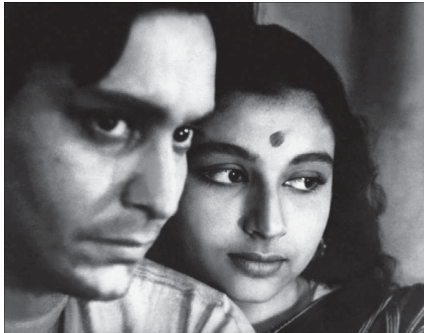
* Soumitra Chatterjee and Sharmila Tagore in Satyajit Ray's Apur Sansar (1959). Chatterjee was known to be one of Ray's favourite actors. Right: Chatterjee at a social event in Kolkata in a 2009 picture.